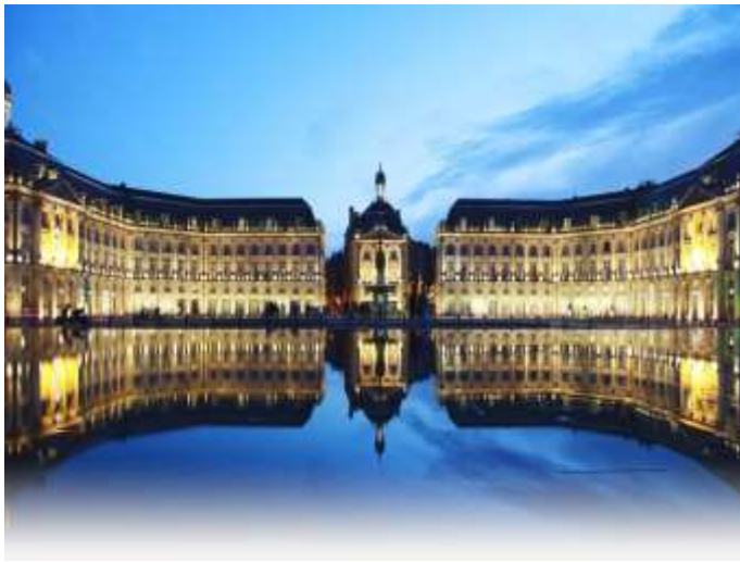
La Place de la Bourse