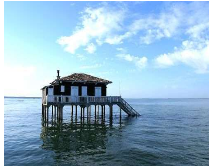
Les Cabanes Tchanquées