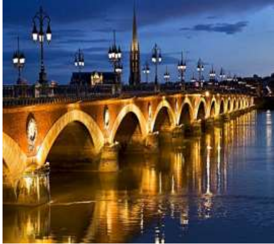
Le Pont de Pierre