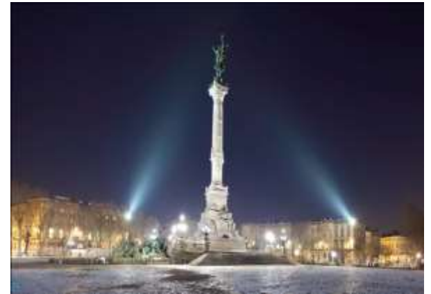
La Place des Quinconces