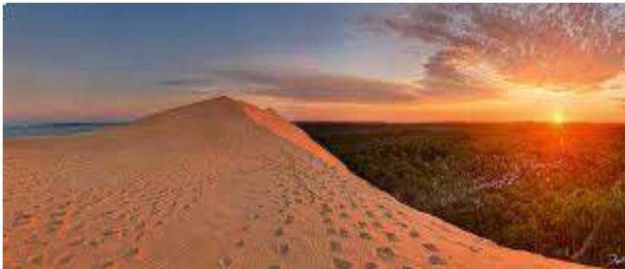
La Dune du Pyla